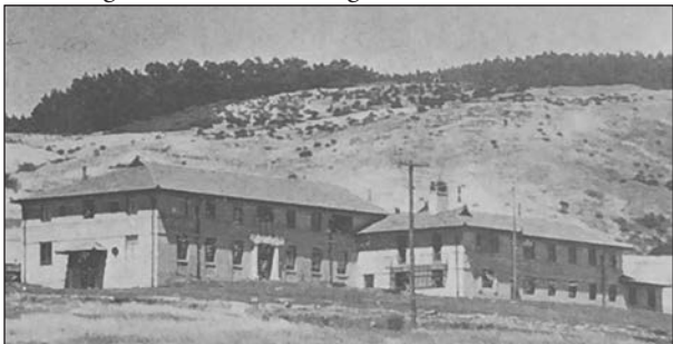
The Chung Mei Home as it appeared when it opened in 1935.

1935 The Chung Mei Home, a safe place for Chinese boys whose parents were unable to care for them, outgrows its home in Berkeley and moves to El Cerrito. It didn’t close until 1954. In 2013 it was determined eligible for listing on the National Register of Historic Places.