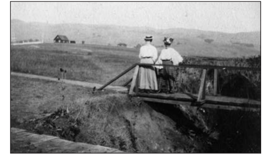
Footbridge on Richmond St. over the north fork of Cerrito Creek.

1913 Community leaders create Stege Sanitary District to install sewers that will provide for residential growth. This requires support from the 285 voters who lived in Rust, Stege Junction, Schmidville, and the surrounding area. The first sewers are installed in 1914.