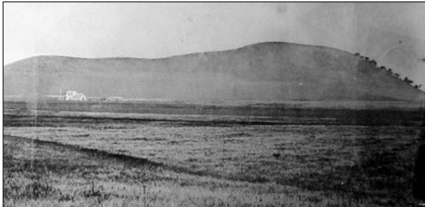
El Cerrito's name comes from "Serrito de San Antonio" (Little hill of St. Anthony.) 1861 Carlton Watkins photo, LL Stein collection.

As El Cerrito celebrates the 100th anniversary of its incorporation, let's look back at some important dates in our history.