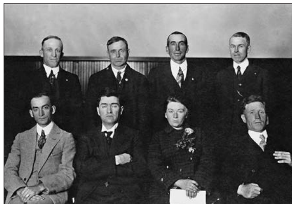
El Cerrito’s first Treasurer, Attorney, City Clerk, and City Council.

1972 Two BART stations are built in town, displacing a number of homes and businesses but enabling a mass transit system that is critical to El Cerrito today.